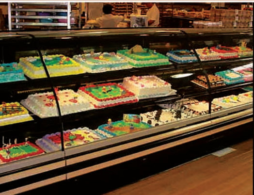
FULL SERVICE →